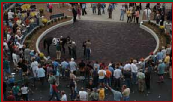
The goal of every owner who races at Turfway Park: the winner's circle.