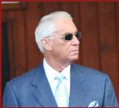
D. Wayne Lukas has earned more Turfway stakes trophies than any other trainer—36.